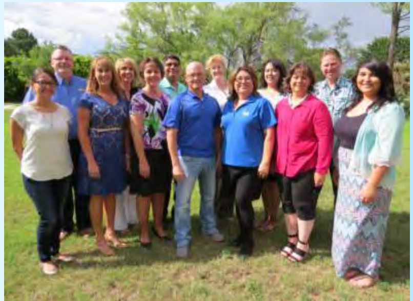
UNITED WAY OF CARLSBAD & SOUTH EDDY COUNTY Community Service Organization Award