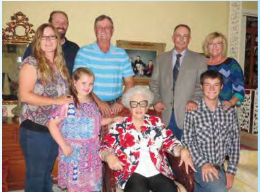
THE BEARD FAMILY Pioneer Award

The awards are to be presented and the recipients' remarkable stories detailed at the Foundation's Annual Dinner on Sept. 17. Tickets are available to purchase at the Foundation office located at 114 S. Canyon Street.