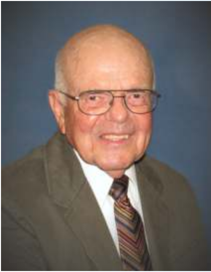
ARCH SLATE Special Recognition Award