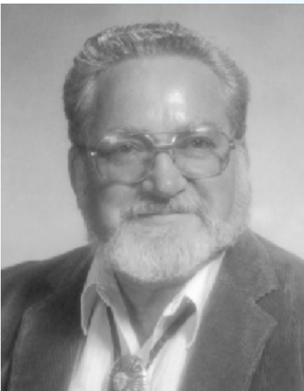
JOHN MILLS Legacy Award